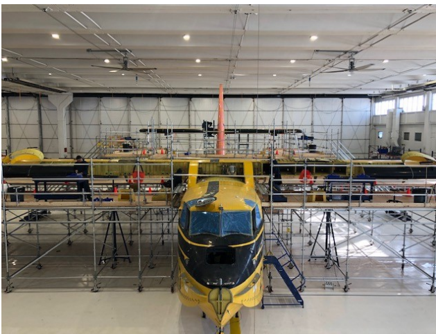
Pictured above: One of the specially selected CL-215 aerial firefighters undergoing upgrade and modification to CL-415EAF "Enhanced Aerial Firefighter" configuration at Longview's facility in Calgary, Alberta utilizing Viking-supplied conversion kits.